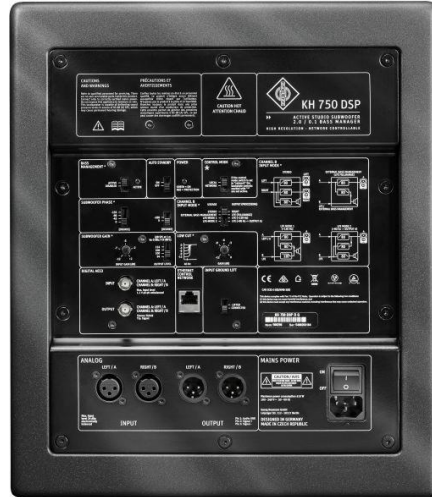
The KH 750 DSP is a particularly compact subwoofer for broadcast, music and post production studios

Neumann studio microphones on show include the BCM 104, KM 184, TLM 103 and the U 67.