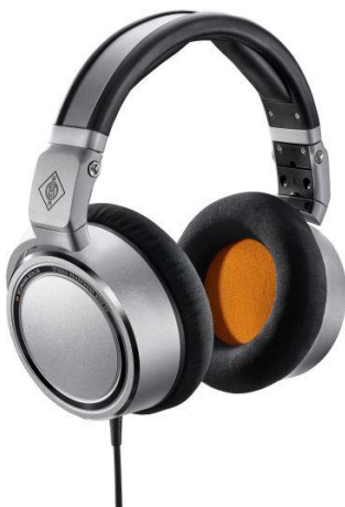
The Neumann NDH 20 studio headphones

When it comes to accurate monitoring via headphones, Neumann's NDH 20 headphones are an outstanding solution for the studio. They are joined by Sennheiser's classic HD 25 as well as the HD/HMD 300 series headphones and headsets for the production studio and ENG work.